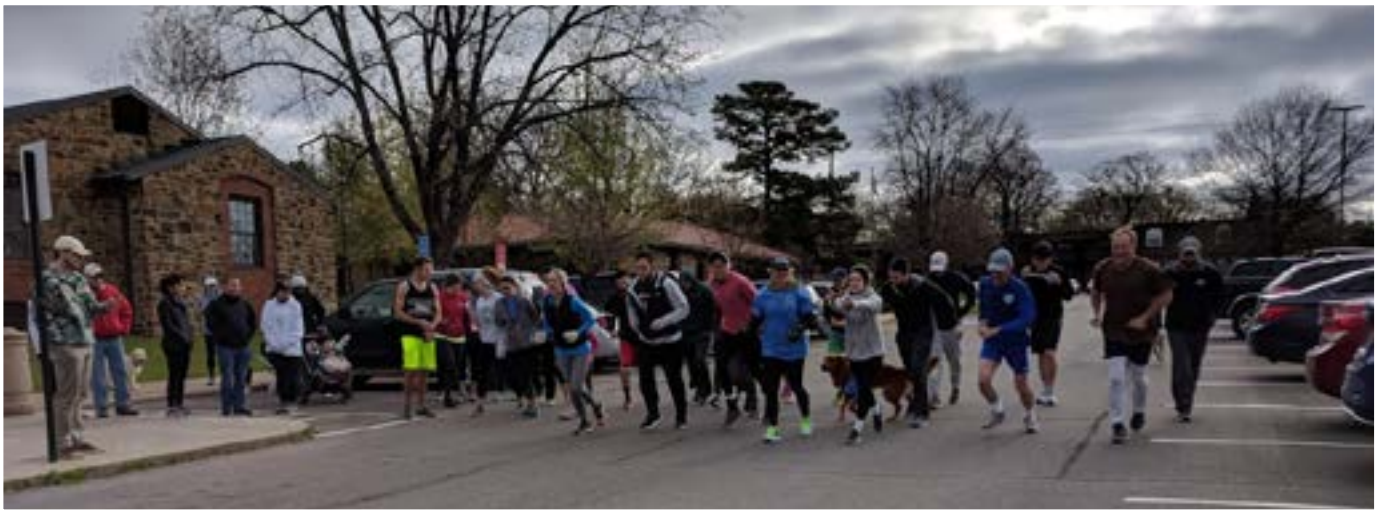
Several people braved the cold weather to participate in the race. The race started and ended in the NSUOCO parking lot.