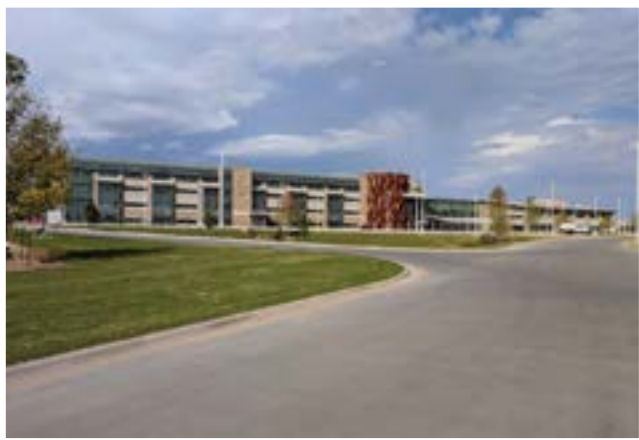
Cherokee Nation Outpatient Health Center

The dispensary in the new clinic offers a display of 850 frames, making it the largest optical of all clinic locations. In the previous clinic, approximately 8,500 patients were seen each year. With the increased size of the new clinic, upwards of 12,000 patients are expected to be seen this year. With all eleven clinic locations combined, an estimated 50-60,000 patients are seen each year.