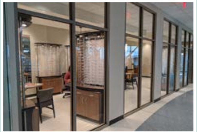
Optometry Clinic Dispensary