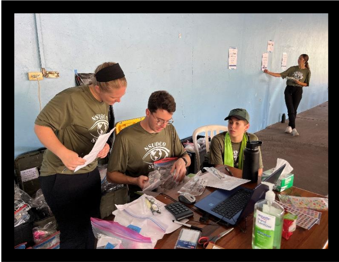
Dispensary at Coxen Hole

We sort, clean, and document prescriptions from donated glasses all year long in preparation for the trip. We fabricate glasses out of donated lenses and frames as well as bring donated sunglasses and readers. All of the glasses have to be sorted, numbered and inventoried on our program on our laptop (this year a backup catalog as our computer program caught a bug right before we left!) so we can find the right prescription when we are with a patient on the island.