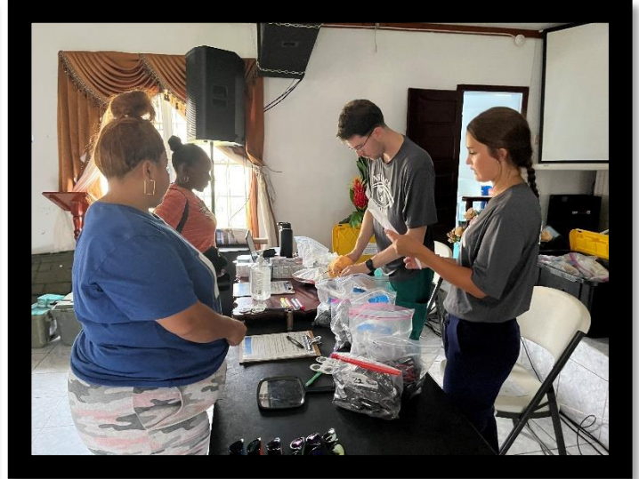
Dispensary at Flowers Bay