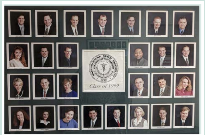
Class of 1999