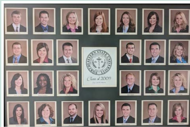
Class of 2009