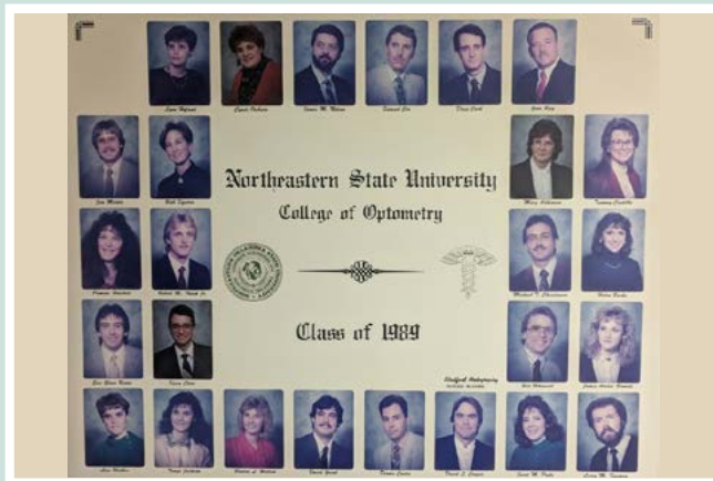
Class of 1989

It is hard to believe that forty years ago, NSUOCO began, giving Oklahoma its first and only optometry program and becoming one of the now twenty-three optometry schools in the U.S.