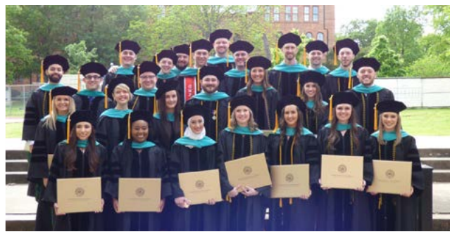
Congratulations to the Class of 2019!