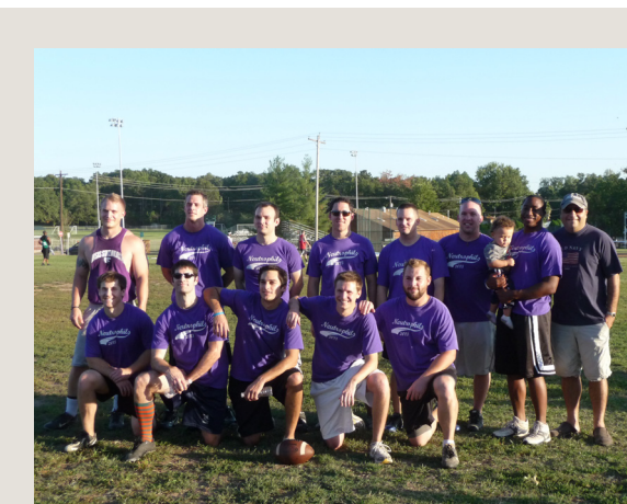
The Neutrophils intramural football team won its second consecutive championship

>> Third and fourth-year optometry students making up the Neutrophils intramural football team won their second consecutive NSU intramural championship on Sept. 29. The team remained undefeated throughout their season, winning a total of nine games.