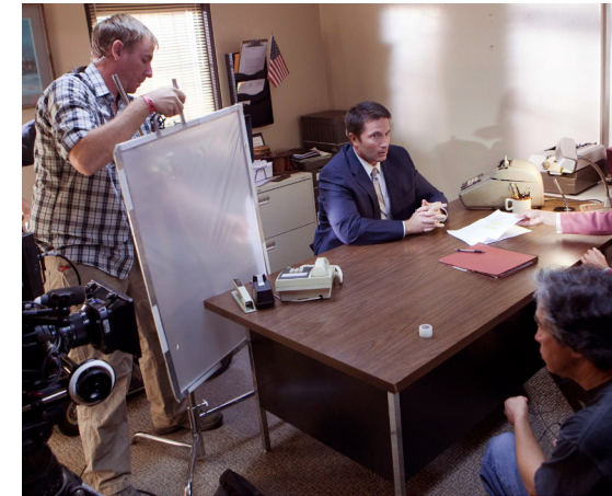
NSUOCO became the set for a film being made about Chief Wilma Mankiller.

The Oklahoma Film & Music Office and the producers of "The Cherokee Word for Water," a Mankiller Project LLC production, filmed pre-production recently in Tahlequah.