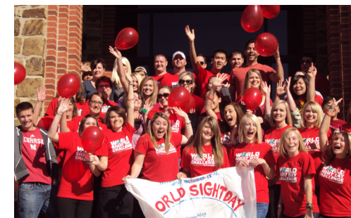
NSUOCO students wore red on Oct. 13 to bring awareness to World Sight Day.

We would like to thank you all for your continual support of SVOSH. It is because of you that we are able to meet the optometric needs of people who would not otherwise receive care.