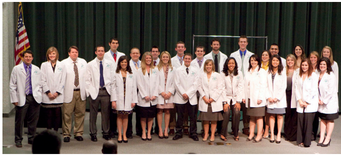
The Class of 2014 received their white coats during a ceremony on Nov. 11.

Second-year NSUOCO students were honored at the 7th annual White Coat Ceremony Nov. 11 at NSU's Webb building auditorium.